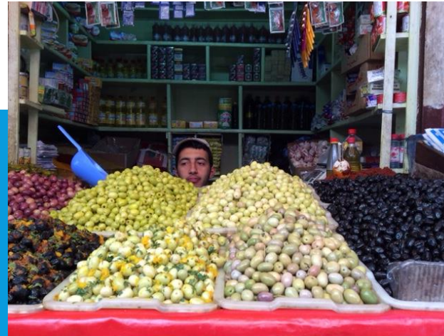
Lots of walking and colour in the Medina(old town). Really enjoying the first few days here. Olives in the Medina, Casablanca.