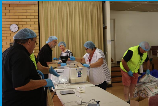
This photo was taken by Bronwyn Fanning at the "hands on" After Conference food packing work party. The packets are a mix of lentils, oats, rice and a packet of vitamin powder which was enough to make a meal for up to 8 people in an emergency situation. I think the boxes we packed were off to the Philippines.