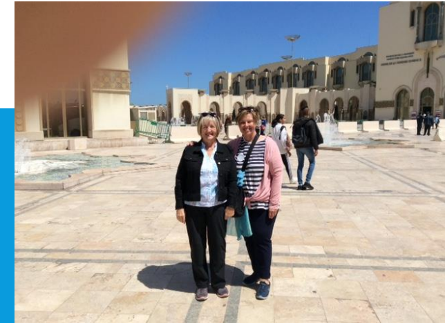
The grand Mosque in Casablanca.