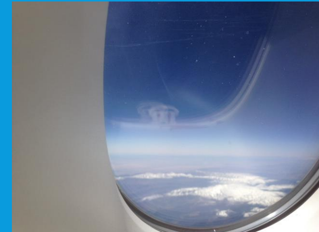
Regards to everyone from Casablanca. All is well and very interesting. Picture of snow covered Atlas Mountains just prior to landing.