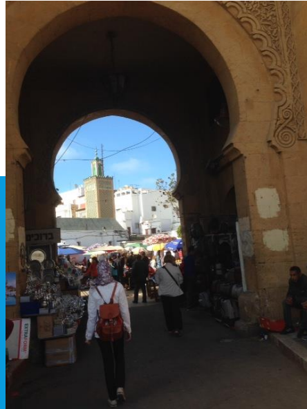
Gate into the old city of Casablanca