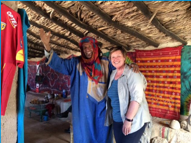
Whilst visiting the Sahara desert this Tuareg chap decided he wanted a fourth wife.