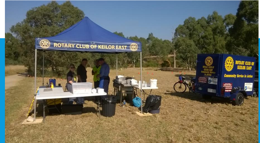
Friends of Steele Creek BBQ – Sunday 22nd April