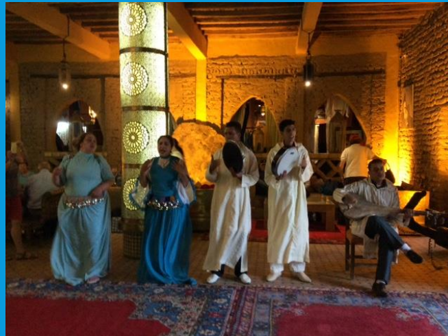
Greeting at our hotel last night. Such a colourful country.