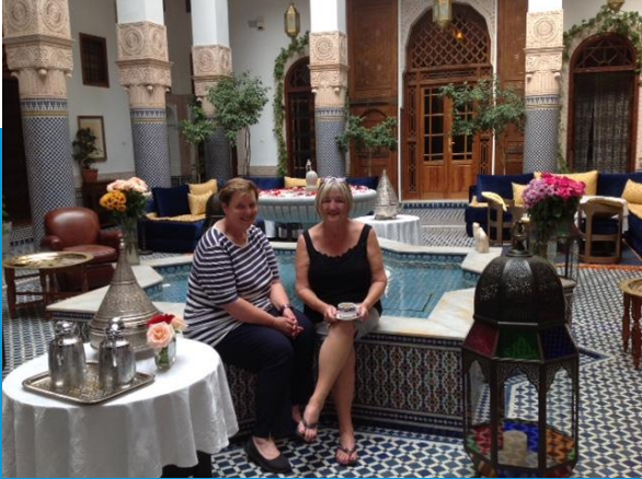
Relaxing in the beautifully tiled hotel foyer.