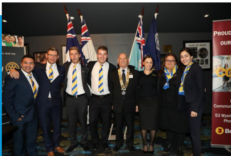
Above - 2017

PARTNER'S AND GUESTS WELCOME- BOOKINGS STILL AVAILABLE - $25 FOR 2 COURSES – CONTACT BOB MCMARTIN