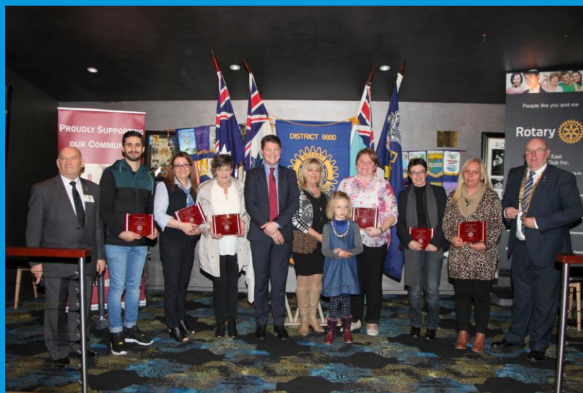
Right - 2016