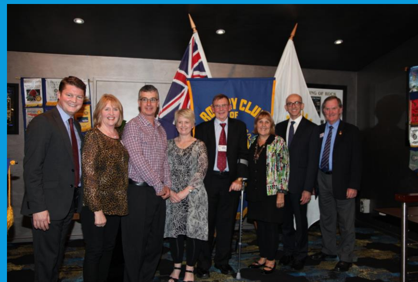
Left - 2014