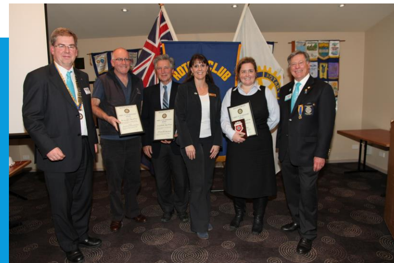
Above - 2013