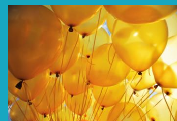
Happy 37th Birthday Keilor East Rotary