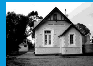
Eddington State School