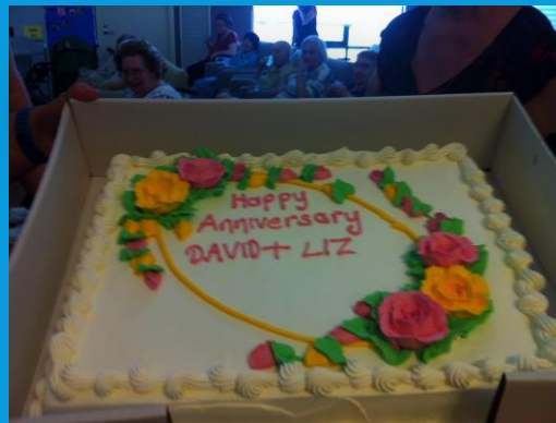
The 50th Wedding Anniversary cake.