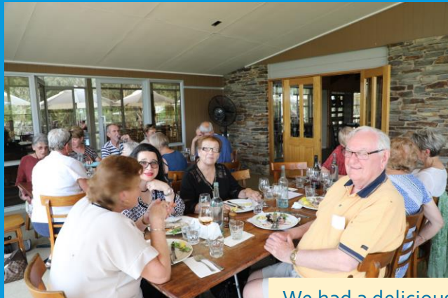
We had a delicious lunch at Morrison's Winery Moama.