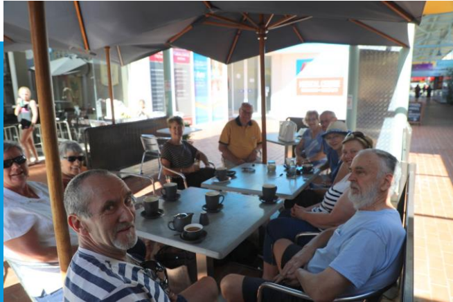
We met for coffee in Hare street Echuca on Saturday morning.