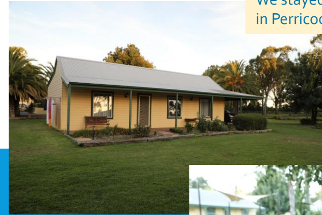
We stayed in cabins at Murray River Resort in Perricoota Road, Moama.