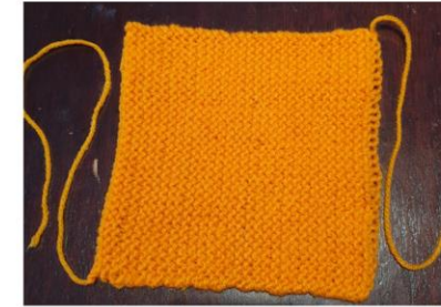
Knitted Square – 15cm x 15cm (6" x 6")

I will be organising a collection of squares, when I am able. So happy knitting or sewing and a super big thank you to you all!