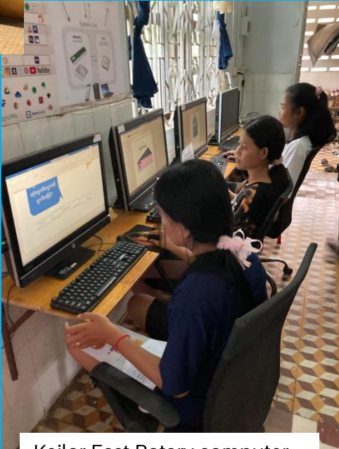
Keilor East Rotary computer lab at Lighthouse.

Project G for girls. We all assembled 150 kits that will be distributed to girls in a rural school with tracing on how to use and info about their bodies and well being. The project G girls were great fun to work with.