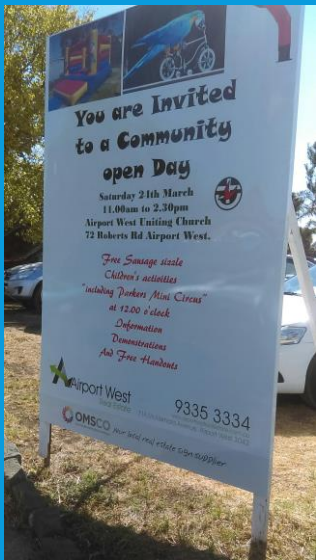
We have a busy weekend with the Moonee Valley Art Show but some families might be able to support this local Open Day.