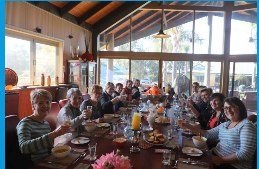
The gigantic table was just right for the delicious 3 course lunch.