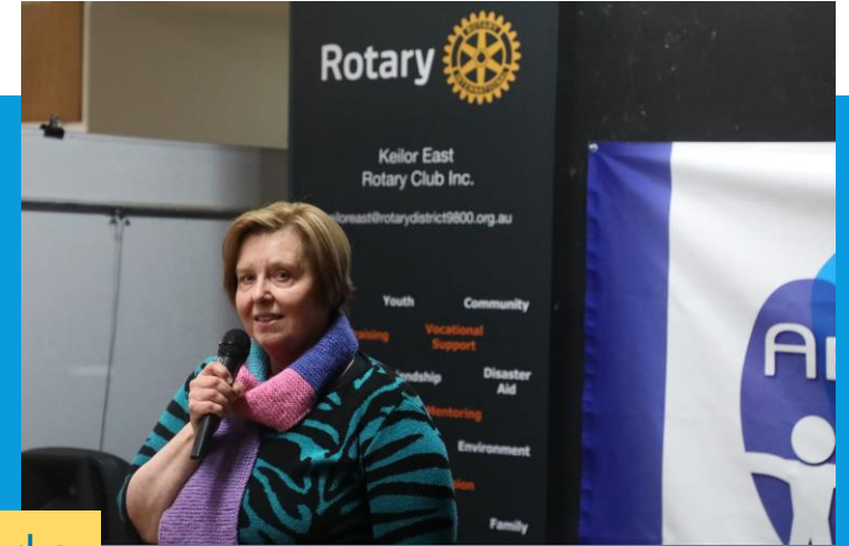
We had a fabulous evening of quizzing, auctions and a raffle. The winning team was "100 Plus".