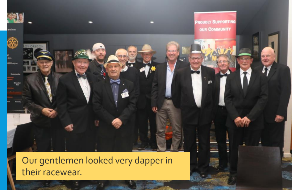
Our gentlemen looked very dapper in their racewear.