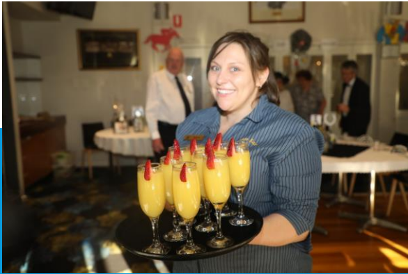
Delicious champagne and orange juice greeted us upon our arrival.