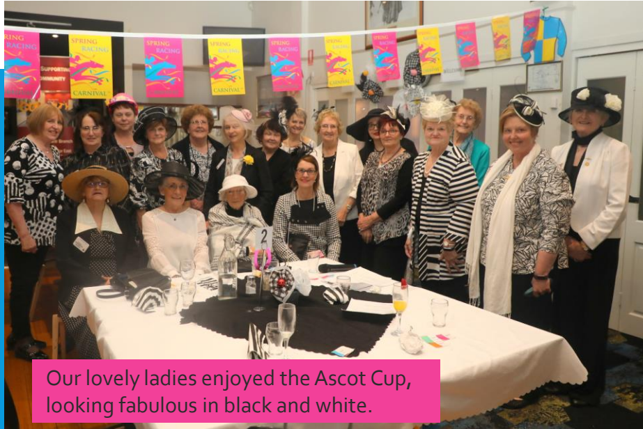
Our lovely ladies enjoyed the Ascot Cup, looking fabulous in black and white.