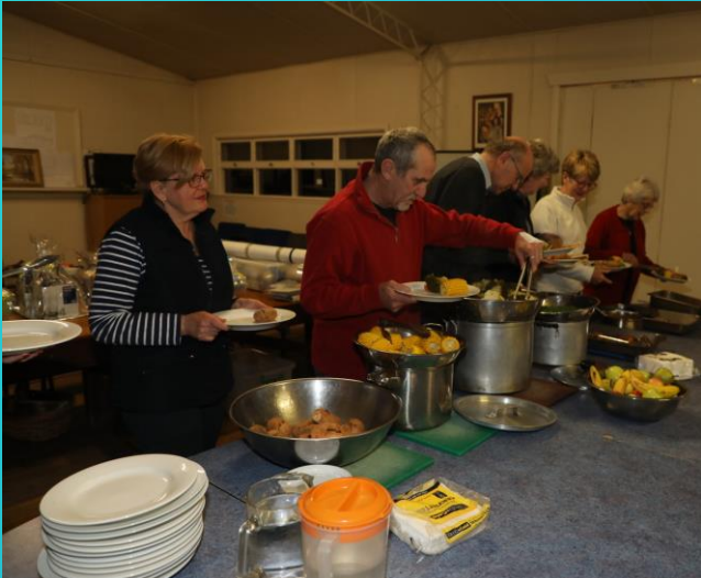
A Buffet Dinner for thirty people was ably provided by the kitchen crew.