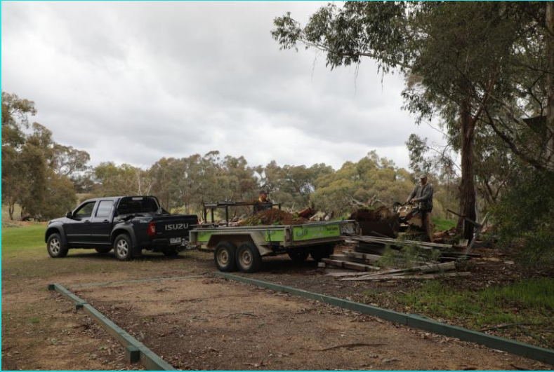
Jock Catto from Bendigo South Rotary has all the right equipment needed for a working bee.